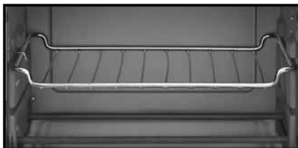
Rack Position C