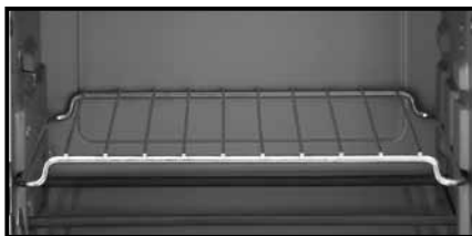
Rack Position B